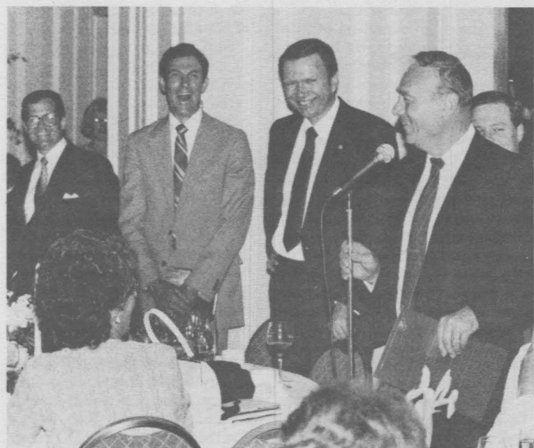
MOMENT OF HUMOR—Pastor General Joseph W. Tkach, ministers, deacons and their spouses share a light moment at a meeting after Sabbath services April 23 in Atlanta, Ga.